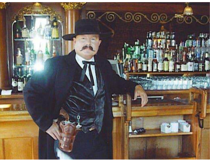
Cowboy Tuesdays at the Belle

Although the formal Cowboy Tuesdays gathering, along with some of the characters, has passed away, the painting, remains serving as a fond reminder to all, that the western spirit is still alive and well at the Strater Hotel, in Durango.